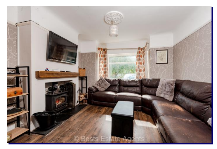
13 Stockham Lane Halton Village Runcorn WA7 2PS 4 Bed Semi Detached House

Independent Family Owned Estate Agents T: 01928 576368 E: Terry@bests.co.uk www.bests.co.uk